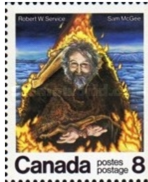
Stamp in commemoration of the poem The Cremation of Sam Magee

Look - my triangular Cape of Good Hope. To purchase it I had to sell my car. Now in my pocket for some sous I grope To pay my omnibus when home is far, And I am cold and hungry and footsore, In haste to add some beauty to my store.